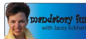
Sibling Rivalry: Fair is what you pay to get on a bus